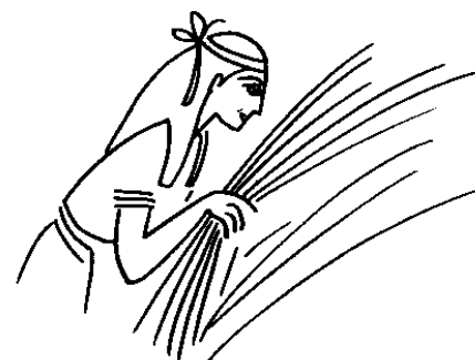
The king's daughter noticed the basket (Ex.2.5)

5 The king's daughter came down to the river to bathe, while her servants walked along the bank. Suddenly she noticed the basket in the tall grass and sent a slave woman to get it.